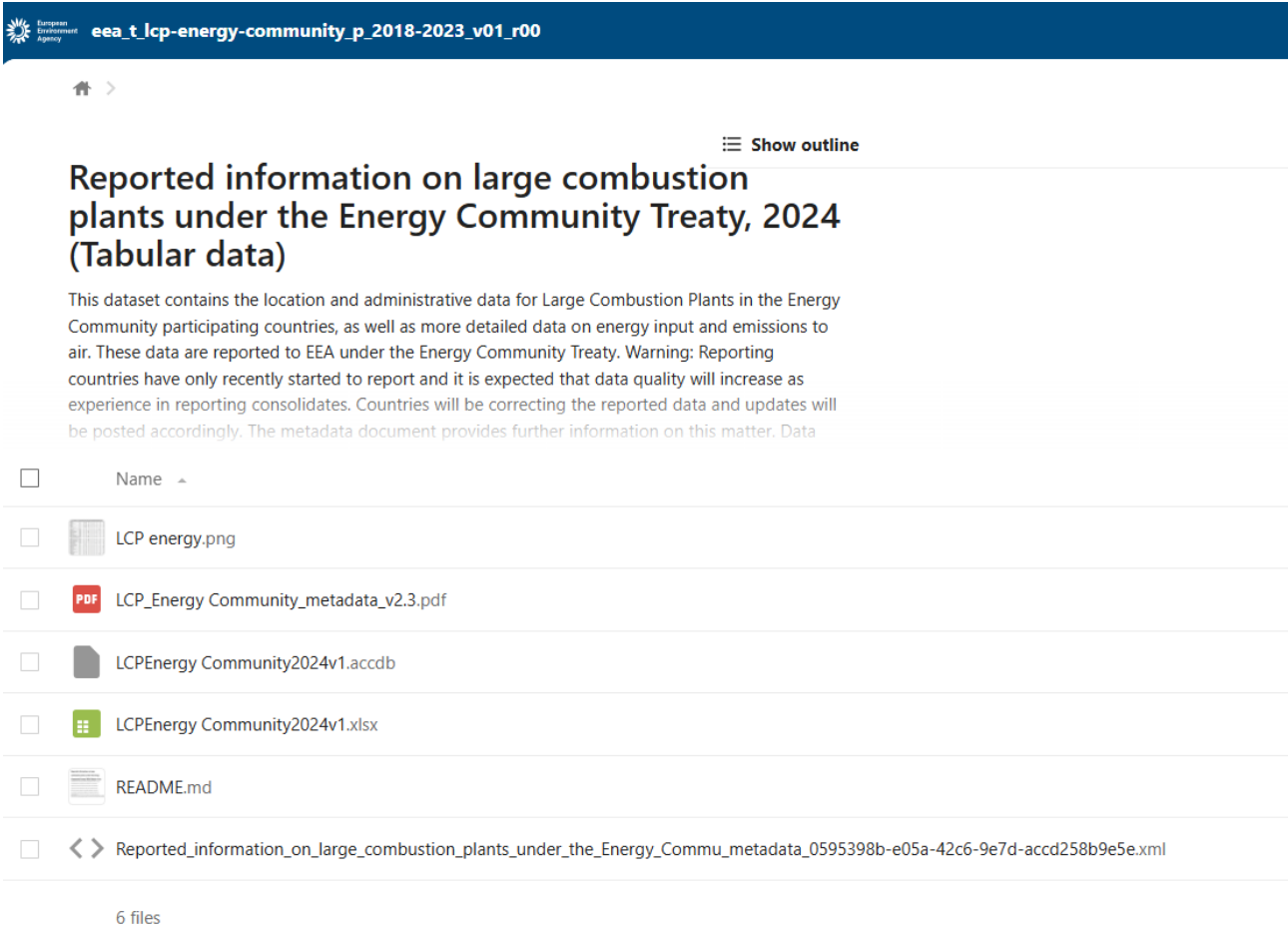
Figure 2 Overview of the content of the fiche of this dataset entry